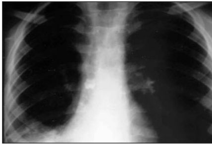
Figure 1: Anteroposterior chest radiograph showing a molar in the bronchus intermedius; atelectasis in the right-middle and lower lobe; and a mediastinal shift to the right.